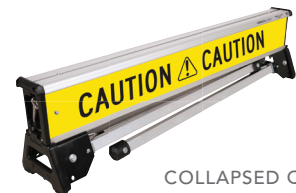
COLLAPSED QDB, READY FOR STORAGE

Solution: Four QDB units in a command truck can effectively close off a street in minutes, freeing up additional police resources for more important tasks.